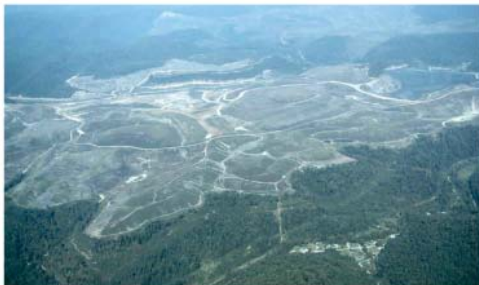
Mountaintop removal proximal to towns and streams.

The vast majority of coal surface mining occurs in 5 of WV's 55 counties (Boone, Kanawha, Mingo, Logan, and Clay).