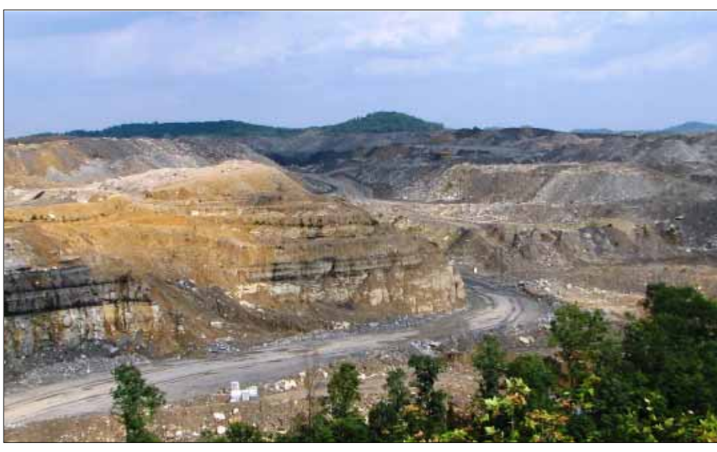
We can only hope that the EPA will view mountaintop removal mining in a different light than the Army Corps of Engineers, which sees this type of wholesale destruction and devastation as something minor.