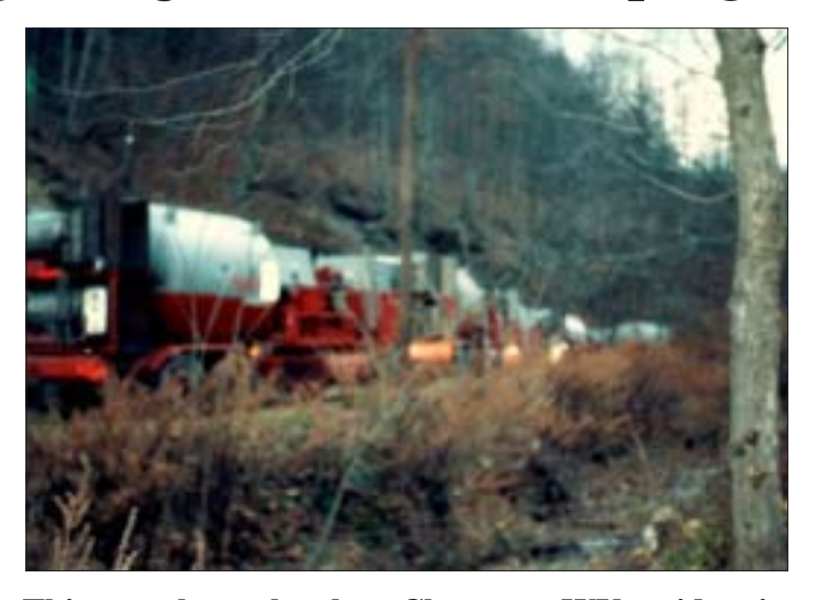
This snapshot, taken by a Chauncey, WV, resident in 1987, shows one of the many convoys of tanker trucks that went up Chaffin's Hollow for three weeks. Their purpose and intent are unknown at this time.

Some trucks had "Halliburton" written on them. At least one truck was blue and white and said "Allegheny