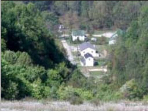
The community of McRoberts, Ky., is situated directly below the TECO mine. The road in the foreground leads to the MTR site.