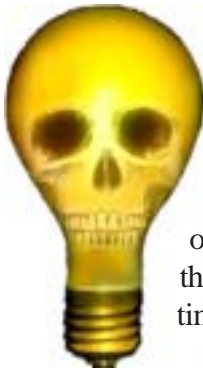
BAD - Coal Energy

The OVEC office uses 300 to 500 kW-hrs of electricity monthly. We agreed to purchase five 100 kW-hr blocks of power each month, ensuring that our office usage is more than offset by wind-generated power. So we are paying $12.50 more monthly (on top of our regular electricity charge) to ensure that we don't blow up the mountains every time we turn on the computers. That's one of the best bargains you'll ever find!