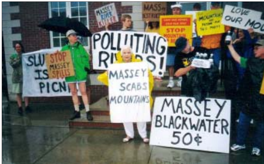
OVEC members' signs pour a rain of truthful words on Massey's public relations picnic.

So as Massey prepared for its picnic, neighbors of its mining operations weren't exactly in the mood to party.