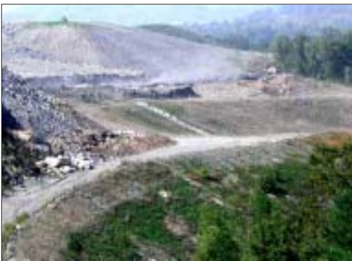
Dust from the mining operation (center of photo) heads directly towards the community of McRoberts.