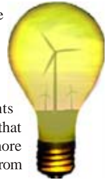
GOOD - Wind Energy

push more onto the grid. Meters at the points where supply pipes join the grid track who has produced how much, and a meter at your home determines your bill.