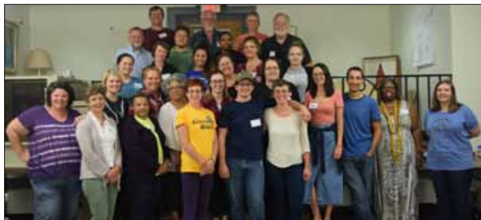
The crew at Train the Trainers.