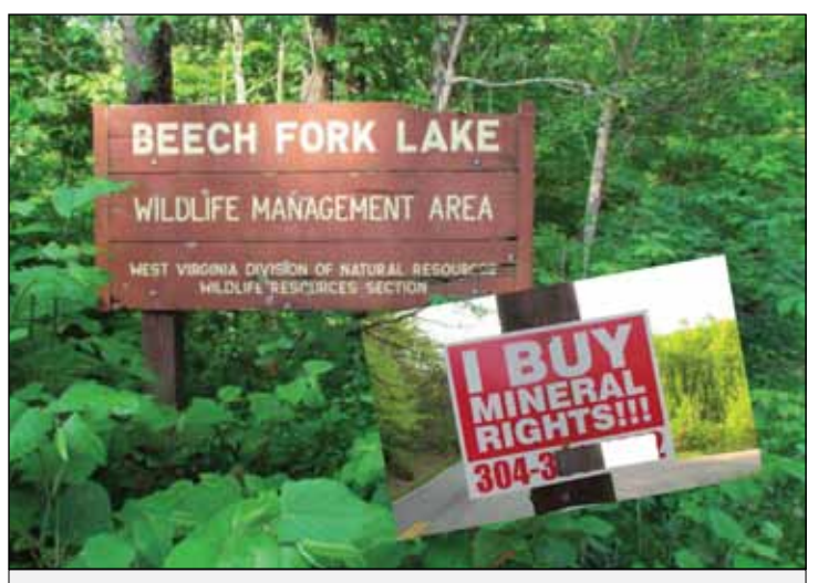
These two signs in Wayne County are about 100 feet apart. The land grab is on, and what does it mean for the health and wellbeing of our communities?

A producing Rogersville horizontal oil and gas well is already operating in eastern KY (Johnson County), but the