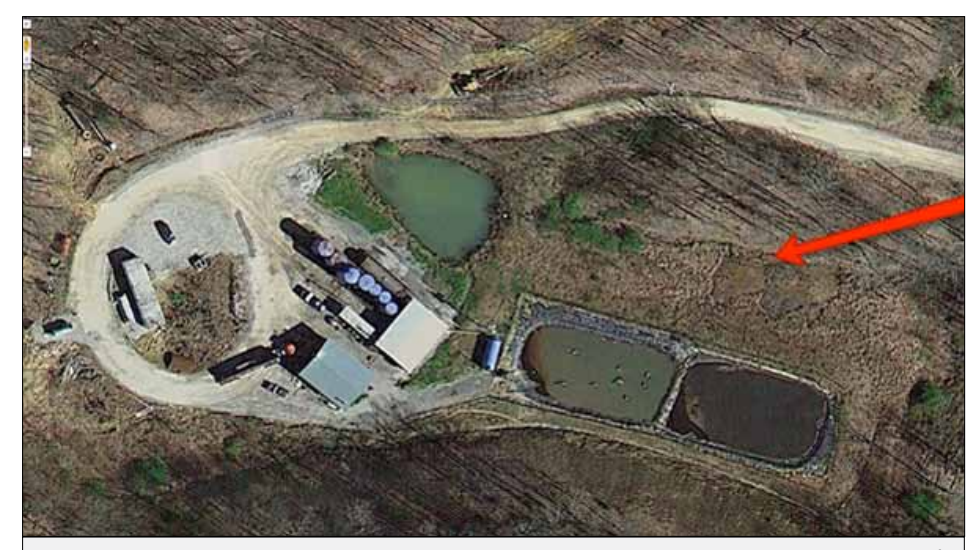
A 2013 photo, courtesy dirtysecretwater.com , shows Danny Webb Construction's injection well and sediment pits in Lochgelly, WV. Above the paired sediment pits is the spot where the fracking wastewater/sludge is believed to be seeping out of the pits and into the headwaters of Wolf Creek. The website says satellite images indicate that the sediment pits have been leaking directly into the headwaters of Wolf Creek since 2003.

Fracking fluid is a mixture of water, chemicals and sand that is pumped into underground shale rock formations to crack them and release oil and natural gas trapped there.