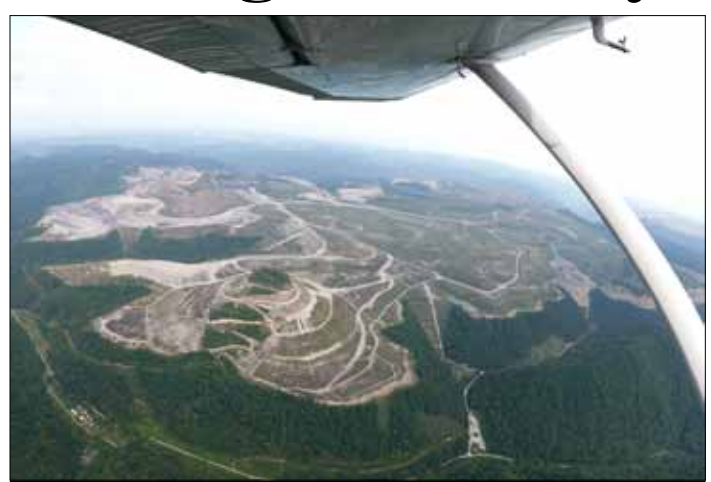
Above: the Massey/Alpha Twilight surface mine complex, with Jarrell Cemetery center-left of photo, above the remains of Lindytown in Boone County.