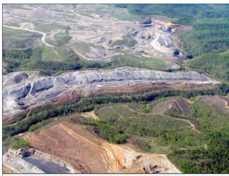
Patriot's massive Hobet 21 mountaintop-removal complex eats up parts of Boone and Lincoln counties and spews selenium and other pollutants into the Mud River Watershed. Above, what remains of Berry Branch. No homes can be seen; everyone left as the mine advanced and their homes were razed.

(The DEP lawyers) said the Patriot plan "threatens to expose the people of the state of WV to the serious public health and safety risks associated