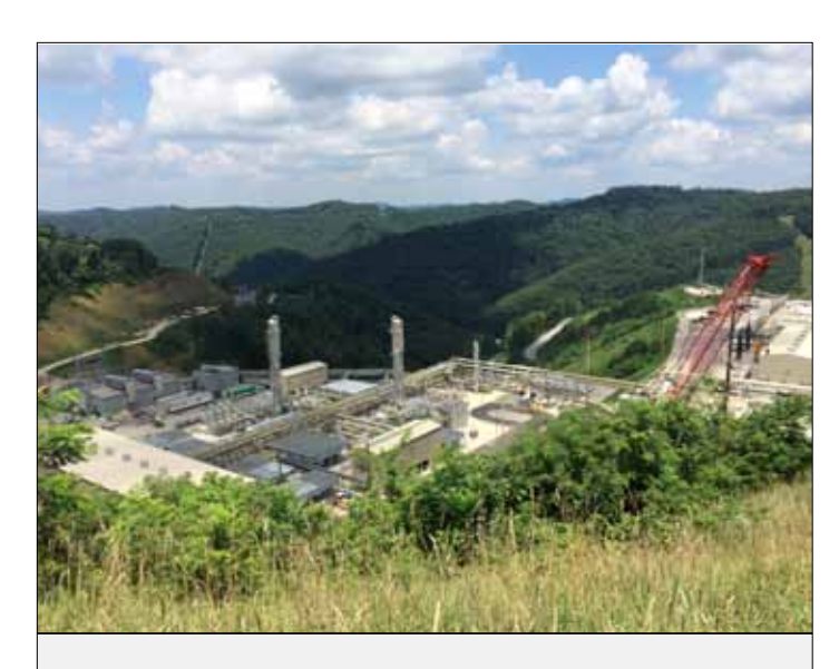
Part of the MarkWest gas processing plant in Mobley, Wetzel County, one of several such scenes OVEC board members pondered on their tour of Fracklandia.