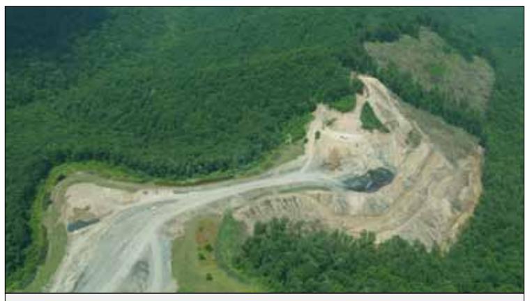
The Gazette ran the above with this caption: This June 2014 aerial photo shows the surface mine adjacent to Kanawha State Forest, which is located in the upper left of the area shown.

In addition to photographing the site to display