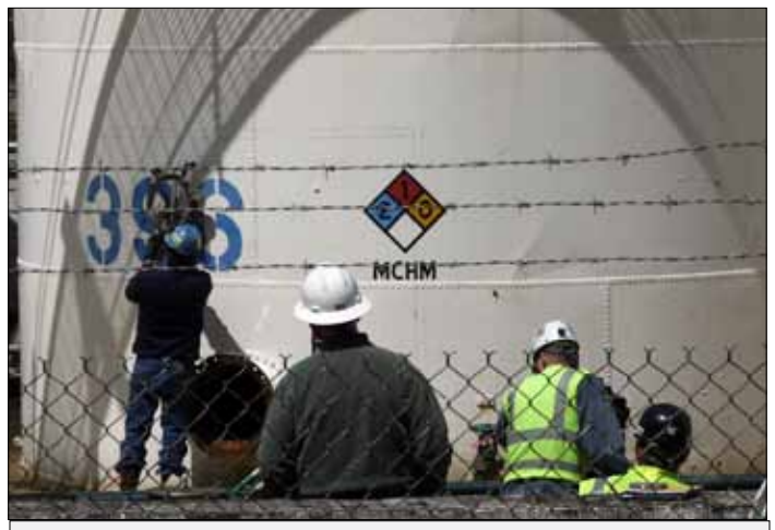
In April 2014, officials began opening tank 396 at Freedom Industries. The tanks are now gone, but the worries are not.

In their plea agreements with the Freedom executives, prosecutors generally dismissed the prospect of seeking criminal restitution — which victims of crimes are entitled to under federal law — as part of the sentences.