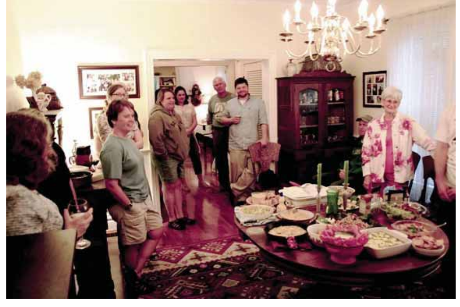
Guests admire the bounty of organic and locally-sourced food at an<br/>OVEC house party.

About 25 guests attended, all bringing a dish with at least one organic or local ingredient. Our table groaned under all the deliciousness – quiches and frittatas with local eggs and asparagus,