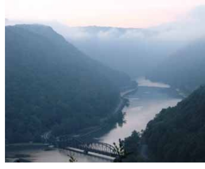
The beauty of Hawks Nest overlook on a misty New River Gorge morning.

When you're finished with this newsletter - PASS IT ON!