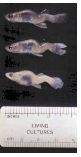
Selenium and fish, not a good combination.

"Although monetary penalties are being sought, much of the harm to the environment is already taking place; legal penalties are inadequate to compensate plaintiffs for their