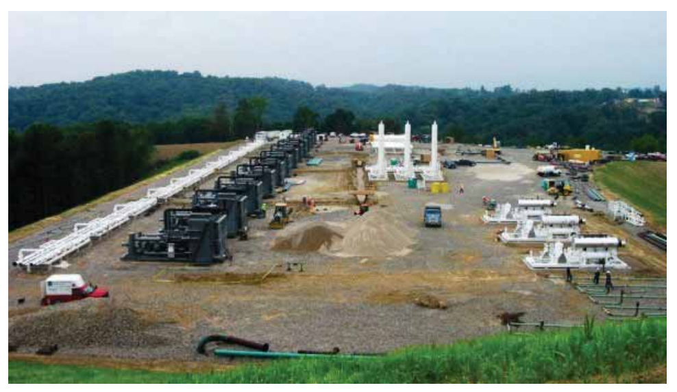
A natural gas compression station - source of constant noise, odors and truck traffic in rural areas.

Among Americans who already are aware of continued on page 18